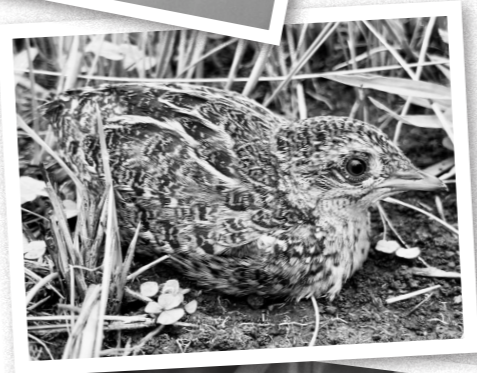
← black-rumped buttonquail