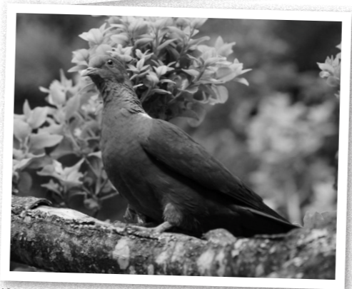
← eastern bronze-naped pigeon