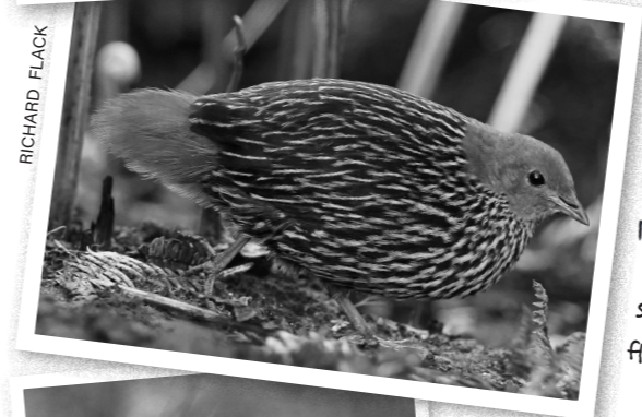
← striped flufftail