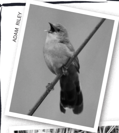
← broad-tailed warbler

There are numerous picturesque rest spots, look-outs and picnic areas scattered throughout Mbona. One not-to-be-missed favourite is the Waterfall Picnic Area, complete with a table and benches. Just follow the Waterfall Path, which branches off Ernie's Walk near Evergreen Dam. Pack some snacks and enjoy!