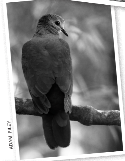
← lemon dove